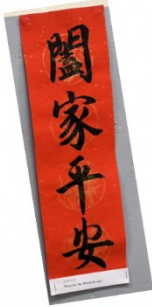
'Peace for Whole Family'