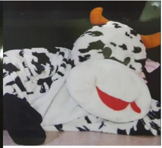
See page 13 for report