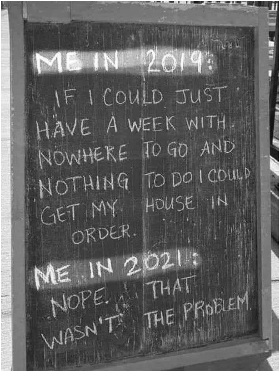
Seen on Facebook – I wonder how many of us could echo this?!